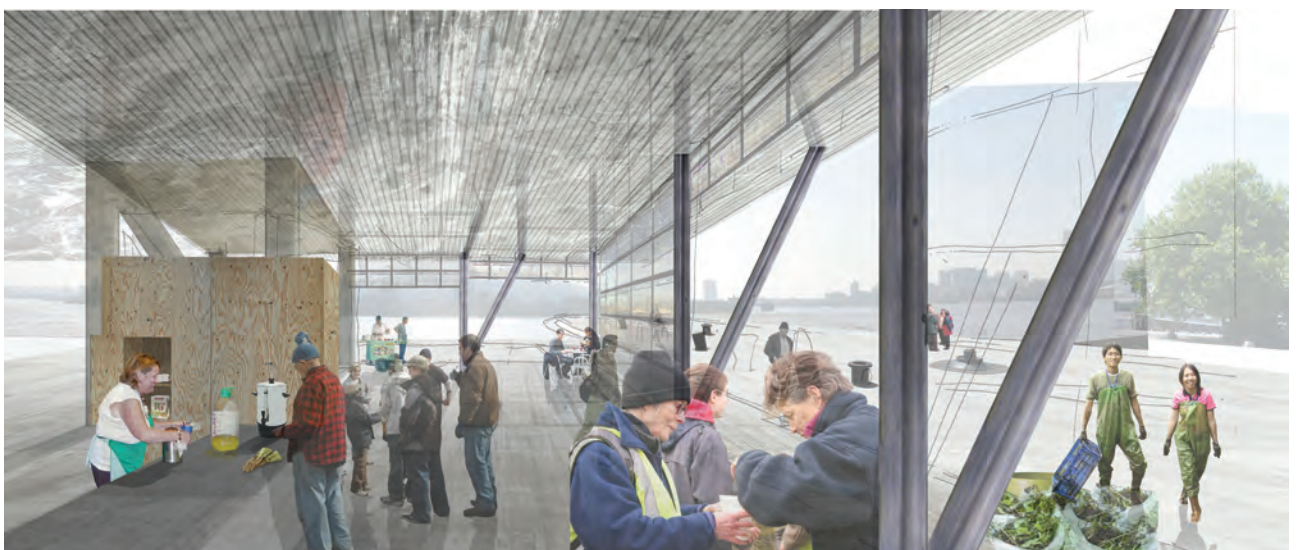
Below A multi purpose dockside room - cafe, restaurant or clubroom.