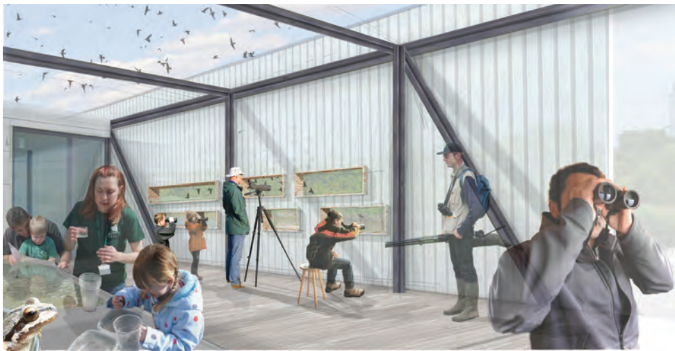
Above The classroom space has views of the basin, nature reserve and across the river Thames. An enclosed roof garden leads directly off from the room.