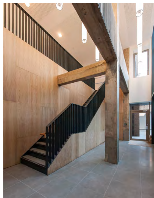
Top Overview drawing describing the ingredients of the scheme Middle The new open plan living space of a penthouse flat. Above Living space within the refurbished Westgate tower. Right Staircase within the common entrance to the residential tower