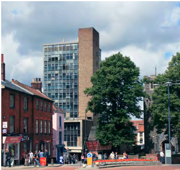
Below Before and after view of the tower from Timberhill