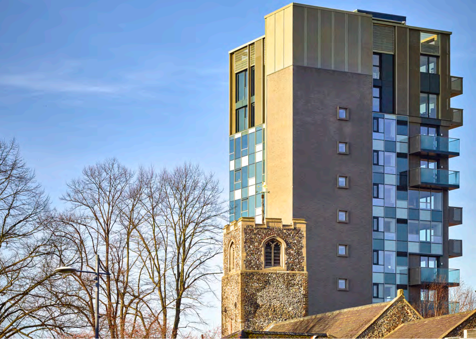
Above View from All Saints Green, illustrating the relationship of the tower to the adjacent church.