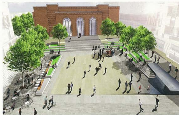
Competition winning entry

This competition winning project aims to reinstate a lost civic space, vibrant but flexible at the heart of the Hammersmith Community. Our proposal provides opportunity for evolution and transformation beyond the permanent framework through community events, arts and cultural activities. The square establishes an appropriate setting for the unveiling of the Town Hall's northern facade and wider King Street Regeneration proposals, with a design that is elegant and fitting whilst allowing the listed building to be the centrepiece. This has been achieved through the creation of a contemporary space that is visually exciting both from within and from above.