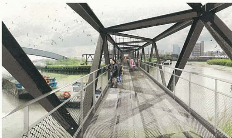
Bridge across the Lea, opened to the public

The Fatwalk is the primary project in the realisation of the Lea River Park, connection between the Thames and the Olympic Park, and enabling a route between the Thames and London's Green Belt. The first phase of works are directed at addressing physical severances and obstructions to create the backbone of the future park. These early pieces of infrastructure are regarded as catalysts for converting what is currently land used for gas storage, sewage pumping and transport infrastructure into diverse park spaces: turning what is an industrial backwater into the foreground of a new public space which people can start to access, use and enjoy.