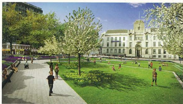
General Gordon Square, view north towards Equitable Building

General Gordon Square and Beresford Square, Woolwich town centre, are set to be transformed as part of Greenwich Council's ongoing programme of major regeneration of the town. This includes the creation of a new public square as part of the Love Lane development and a new public space in the Royal Arsenal. Works are complete on the new super crossing on Beresford Street, which will improve pedestrian access between Beresford Square and the Royal Arsenal. The transformation of the squares will coincide with the launch of the Greenwich Waterfront Transit (GWT), a new and improved, dedicated bus route between North Greenwich Tube station and Abbey Wood. These projects represent an important element of Greenwich's contribution to the regeneration of the wider Thames Gateway.