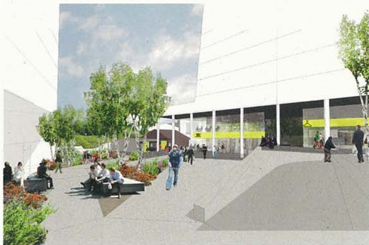
View of the new square looking towards North Acton Station

North Acton Station, on the edge of Park Royal, currently suffers from poor access and visibility – hidden behind a range of buildings, lying below street level, and approached by isolated footpaths. The project will provide a new public space which enables a direct and generous connection between the station and the street, and helps to address a wider open space deficiency. The space aims to exploit its unique topographical and landscape context – using the level change between station and street to help establish a distinctive character which relates to the borrowed landscape of the railway embankments beyond.