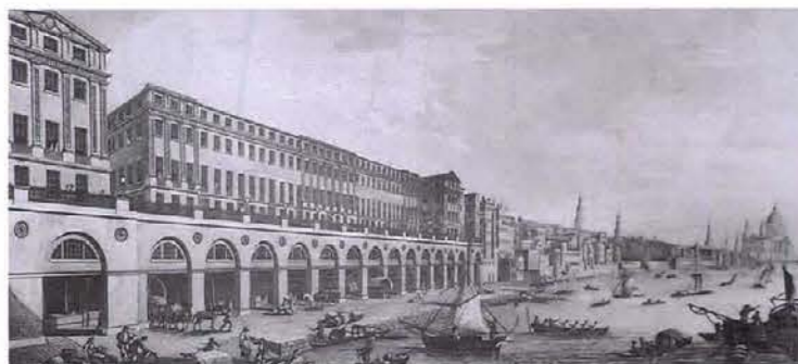
The Adelphi's main terrace sat on an arcade of warehouses above the Thames.

Inspiration The Adelphi Architect Adam brothers Completed 1768-1772 Location Embankment, London