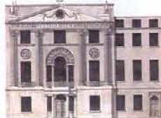
Robert Adam's original elevation drawing of the RSA buildings.

Much of the surrounding Adelphi streets survive as well as remnants of some of the vaulted spaces and underground roads beneath the hotel. The RSA, which has expanded along the terrace from its original two houses, retains much of its original Adam interior including finely decorated ceilings and fireplaces. The street is used frequently for filming — one of the RSA's doors is a regular stand-in for 10 Downing Street.