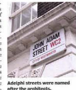
Adelphi streets were named after the architects.

position between the river and the Strand and turned it into a social structure, with the working Thames below and the new artistic upper class in the houses above. I find the way you can get from rough landscape, right up to this incredibly fine articulation in the decoration of the interiors, tremendously engaging. The brothers Adam saw this whole gamut as part of their role as architects — from reclaiming land from the river and making spaces