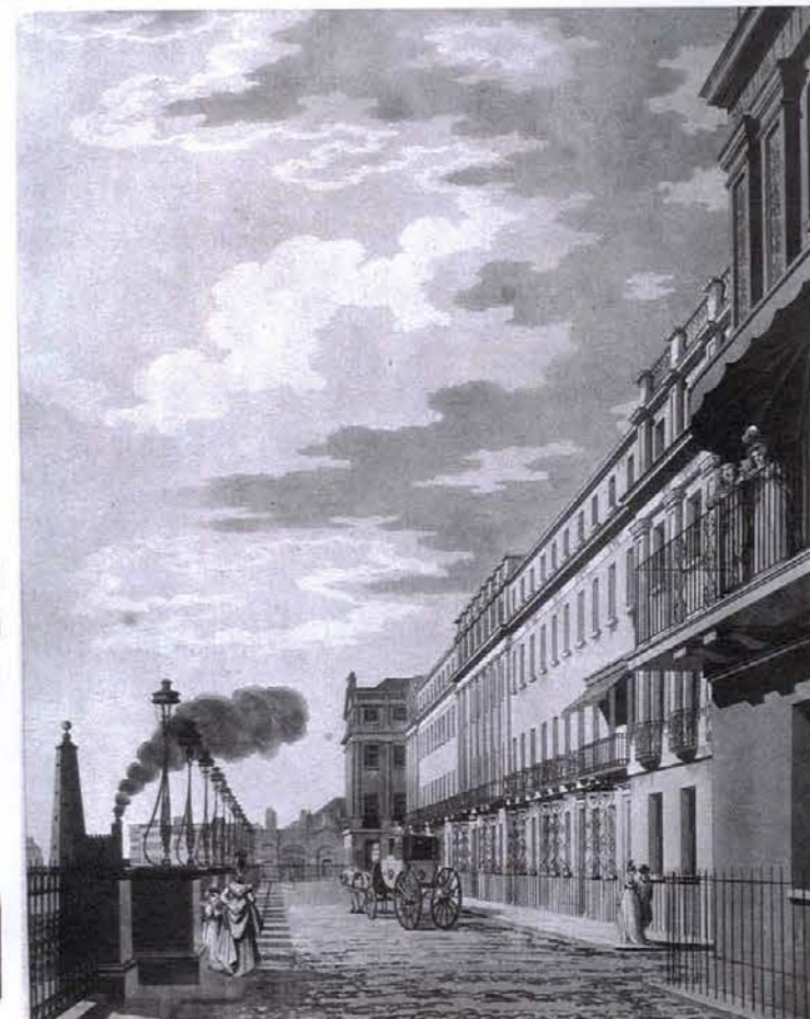
ADELPHI TERRACE This 1770s illustration by Malton Thomas shows how the riverside Adelphi development attracted a rich mix of avant-garde Londoners to the Strand area.

law in the Inns of Court and the Temple, through to an incredible number of new urban typologies and practical ideas on urban improvements. Among these Strandside innovations lies Bazalgette's great sewer, a stretch of the world's first underground metropolitan railway, and an early example of a relief road in the form of the Victoria Embankment. From the medieval period there were a whole series of palaces along the Strand: the powerful of Europe had to have representation here to be part of London's political milieu. By the middle of the 18th century these palaces had gone, and the Strand was considered "untidy and malodorous". Into this unpromising environment, the brothers laid out the Adelphi — a city block with twin aspects: a quay against the Thames (then the engine of London's economy) with a huge series of cave-like warehouses and internal roads; and an urbane series of streets built on a massive deck off the Strand, with four-storey houses, each having two storeys of cellars below to house service accommodation. The houses were finished and decorated by some of the finest artisans in Europe, and they were joined by coffee houses, a tavern, a hotel, accommodation for an emerging professional class and the then-youthful Society of Arts, Manufactures & Commerce (now RSA) on John Adam Street, which remains largely intact. The Adams' proposition took a