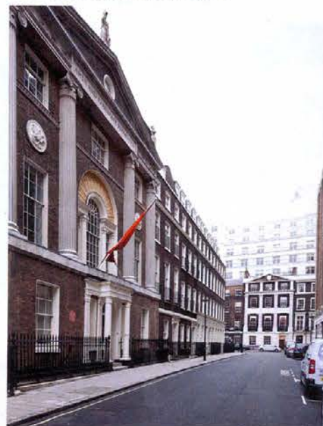
The RSA's headquarters on John Adam Street.

The Adelphi development between the Strand and the Embankment in London took its name from the Greek word, adelphoi, for brothers — appropriate as it was built by the four Adam brothers: John, Robert, James and William. It consisted of the Adelphi Terrace, a block of fine houses above wharves plus the surrounding streets including John Adam Street, home of the RSA.